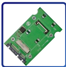
mSATA to SATA Adapter-P1041