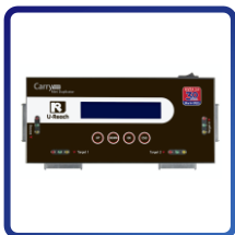
PRO398 Duplicator x 1