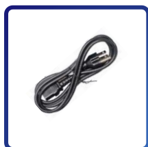
Power Cord x 1