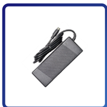
12V Power Adapter x 1