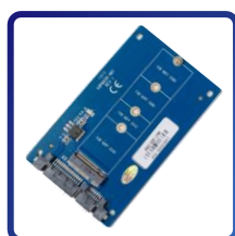
M.2(NGFF) to SATA Adapter-P1051