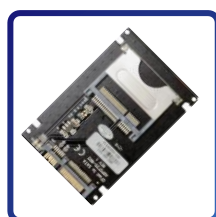
CFast to SATA Adapter-P1053